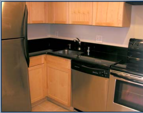
Stainless Steel Appliances