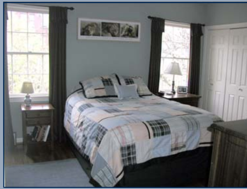
Extra Large Bedroom